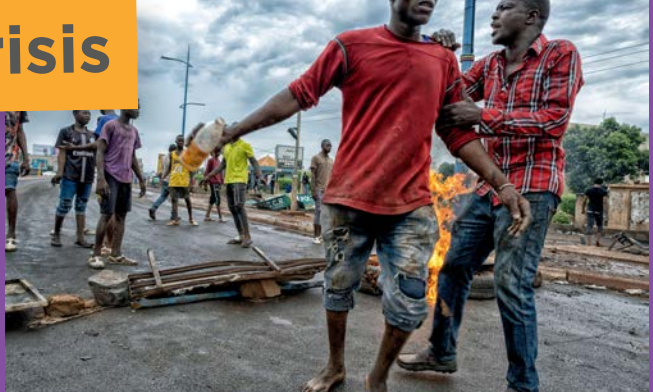
iolent protests rock Mali in the midst of a military coup and jihadist threats.