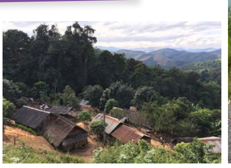
Typical Hmong village in a remote highland location.

*Names have been changed to protect the identity of those mentioned.