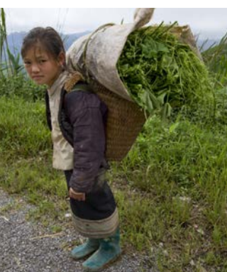
Child labour is common amongst the marginalised Hmong.