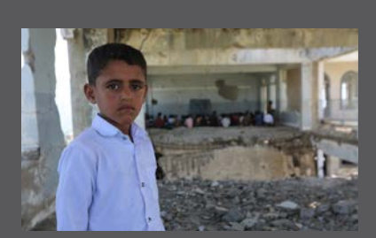
A Yemeni child is in his school, destroyed by civil wars. The class is in session in the background. More than one in five Yemeni children feel afraid or depressed constantly.

In the midst of this prolonged oppressive