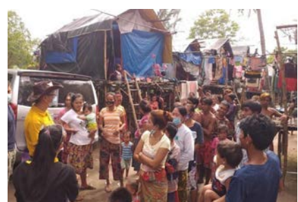
Feeding physical and spiritual food to the Badjao community in Santiago City, Isabela

Through 13 local radio stations broadcasting in 42 languages, FEBC makes the gospel culturally relevant for these often-overlooked ones. On Palawan island,