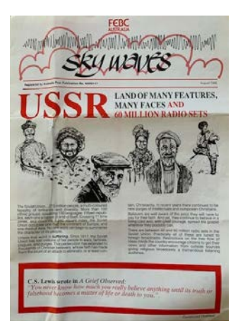
Skywaves Aug 1986, when Russia was still the Soviet Union

Less than two percent of the nation identify as evangelical Christians. Russia is becoming more and more authoritarian, as political and religious freedoms diminish rapidly.