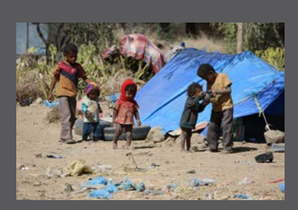
Displaced Yemeni children. An estimated 11 million children are at risk of malnourishment.

darkness, FEBC partners in Yemen have been shining the light of Christ, seeking to nourish hearts famished of all hope, and giving practical support. Programmes on shortwave radio tackle the real problems that the Yemeni community face. Follow-ups on Facebook and social messaging provide the human touch. Biblical perspectives are introduced through teachings, such as on the parables of Jesus and the sermon on the mount. Presenters also encourage listeners to call in and respond in a segment called "Hot Issues".