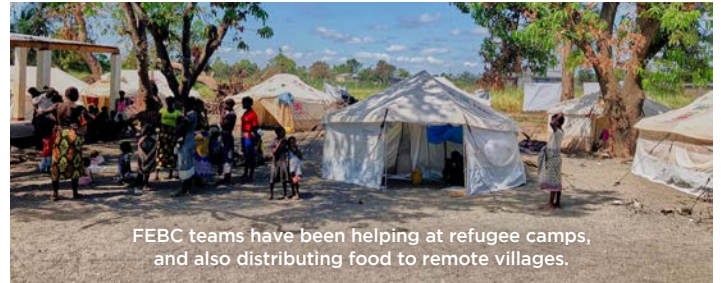
FEBC teams have been helping at refugee camps, and also distributing food to remote villages.

Bright, the Director of FEBC Mozambique is actively bringing help to those in remote areas where aid agencies are not reaching. With no food, water, and shelter, God's provision through the team has been critical. 160 bags of mealie meal (a staple in Mozambique), harvested from FEBC Mozambique's own maize farm has been distributed. At each refugee centre for those internally displaced, there is a team from FEBC Mozambique to help refugees connect to the station with requests of their practical needs.