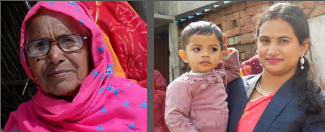
In rural areas, women and the 'girl child' are seen as objects to be controlled.

In rural areas, women are mainly seen as a liability to the family. Mothers and 'girl children' are often objectified and controlled by male patriarchy. 'Girl children' are not encouraged in education, made to work early to earn for the family, and are often married under the legal age of 18. The coronavirus pandemic has only exacerbated the crisis.