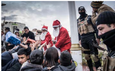
Iraqis are desperate for peace, joy and hope in a country troubled by violent unrest for years.

To bring restoration and healing, FEBC's partners have been broadcasting the Christian message of love, hope, forgiveness, and peace via community-based Iraq FM. Twenty-one programs, including seven live ones, are produced weekly. Dialogues about social issues such as violence against women and children and anger management support listeners emotionally and mentally. Entertainment programs provide relief from the pressures and problems of society. There are also fun programs for children and