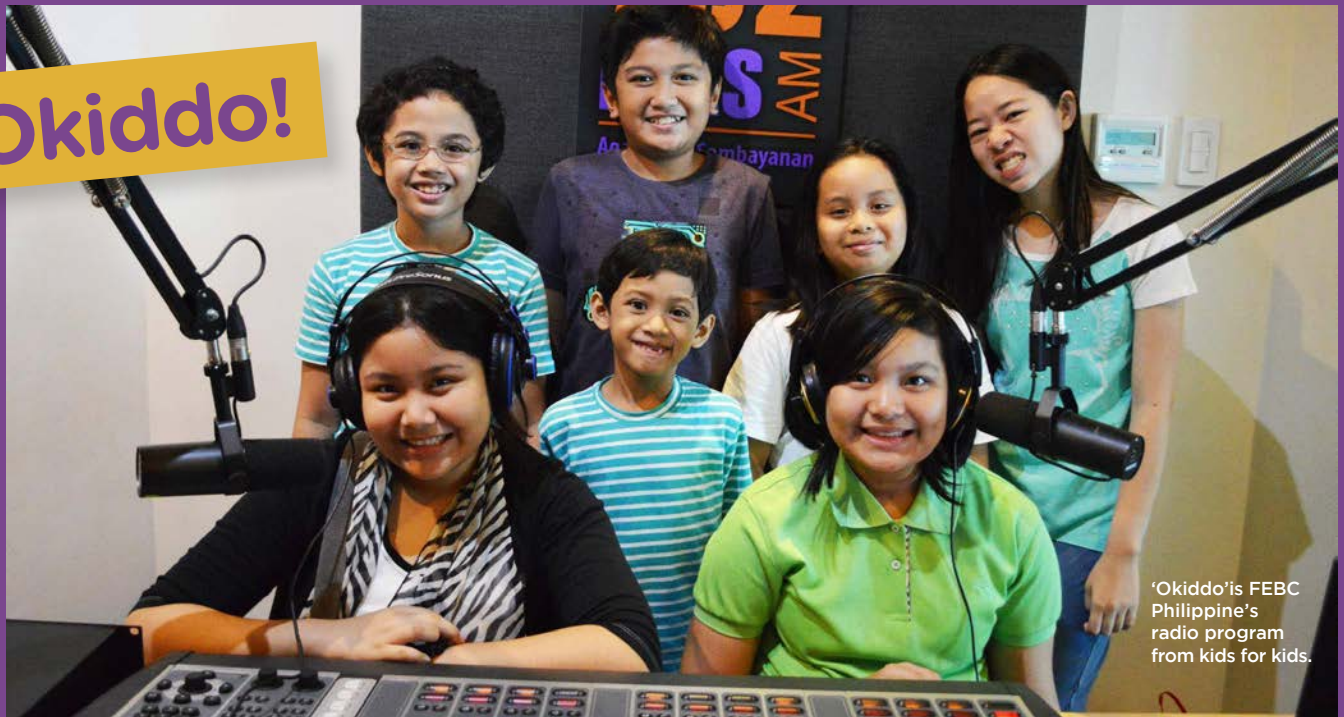
'Okiddo' is FEBC Philippine's radio program from kids for kids.

When God came down to be with us as one of us, He chose to come as a helpless babe, reliant on Mary and Joseph to provide for Him. Yet there was no mistaking who He was. The tiny baby was the Wonderful Counsellor, the Mighty God, the Everlasting Father, the Prince of Peace, prophesied by Isaiah. By the time Jesus was twelve, He was preaching in the temple. Such wisdom from a small child was unexpected by the society; but not by God.