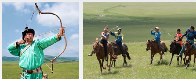
Mongolians are proud of their heritage.

What has often been passed down for generations is Tibetan Buddhism. On the family altar, inside the gers (yurts) of Mongolian herders, are Buddhist idols.