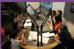
'Okiddo' kids hosts in action - recording, on the road, and dramatizing a Bible story.

Click here to watch a video about 'Okiddo'.