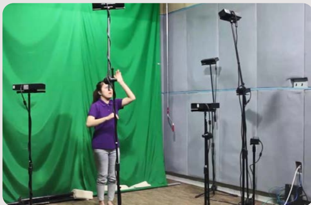
FEBC Vietnam engages deaf volunteers to produce 3-D animation to share Bible stories visually from their own perspective.