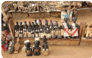
Sangomas or witch doctors in Africa use black magic to curse and to kill.