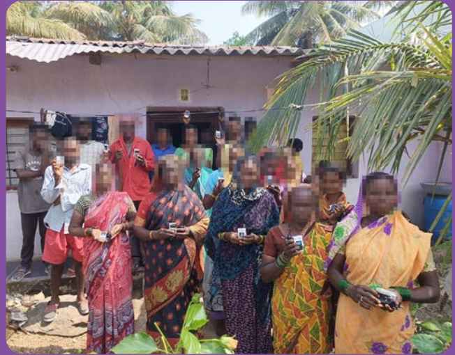
A Siddhi community with their speaker boxes. Photo blurred for security reasons.

And God has been setting the captives free. Alcoholics have been set free from their