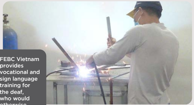
FEBC Vietnam provides vocational and sign language training for the deaf, who would otherwise not get an education and a chance at a better life.