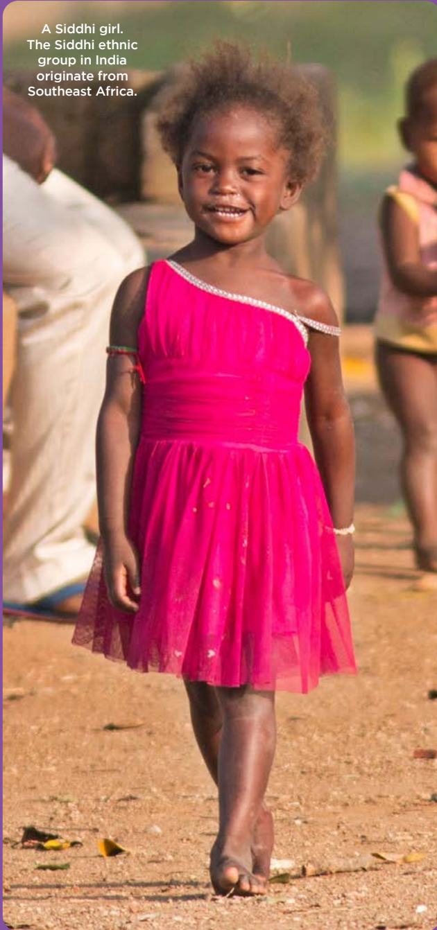
A Siddhi girl. The Siddhi ethnic group in India originate from Southeast Africa.

The Siddhis of a southern Indian state are a unique community. Descended from Bantu peoples in Southeast Africa, they were brought to the Indian subcontinent as slaves. When slavery was abolished, many fled into the jungles, where most work as farmers today. Though assimilated into the Indian culture, they are often seen as outsiders and alienated.