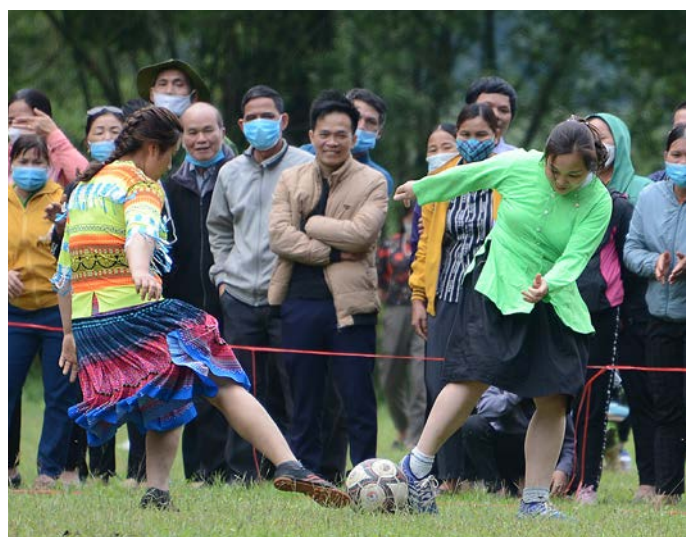
Shan and Hmong Ladies Cup help the women gain confidence.

“From that day until now, I have felt better. We are hopeful when having God. I rely on God every day. There were no excellent teachings before I knew God, and I didn’t understand the Bible well. Now my husband and another two children still don’t believe in God. Please pray for them.”