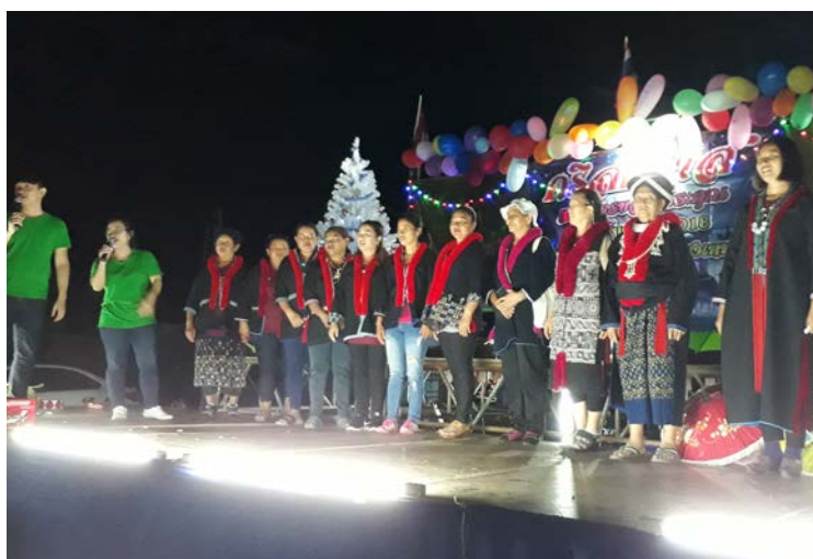
Special Christmas programs online or onsite run by local ethnic leaders let their ethnic communities know that Jesus came also for them.