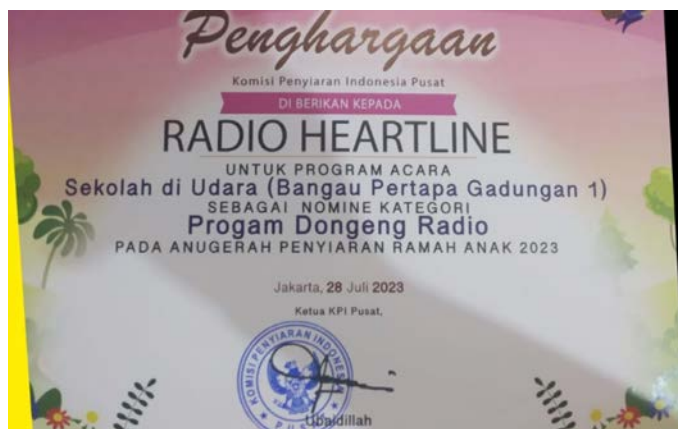
FEBC Indonesia's Heartline Radio winning the top five child-friendly radio stations in the country.

Webinars and online courses on parenting, daily radio programs for parents, children and youth, and physical conferences and counselling sessions reach a potential audience of 10 million. The radio station recently won the top five child-friendly radio stations in Indonesia!