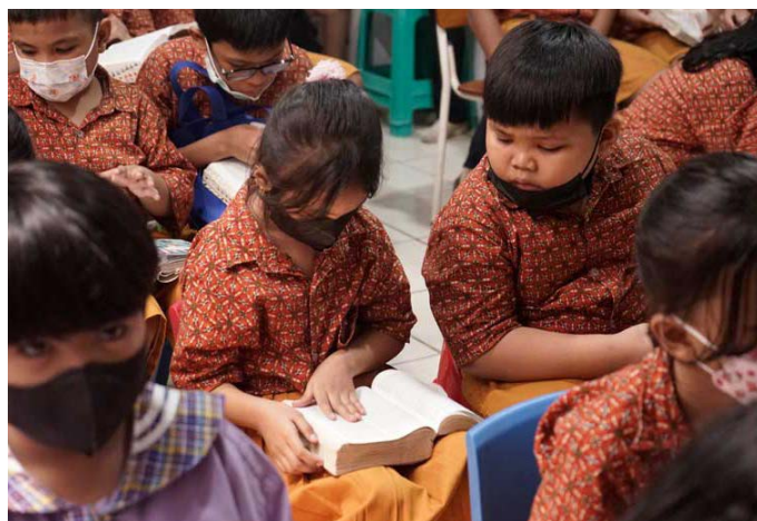
Christmas last year reaching children with the BDKA program.

"The children become enthusiastic to meditate on God's Word with new method (BDKA)" – teacher in Makassar