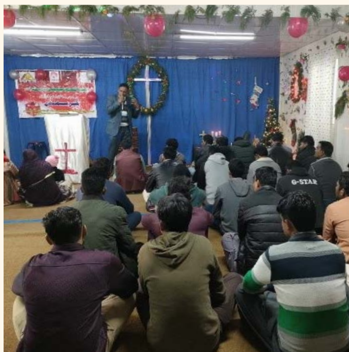
Pakistani Christians celebrating Christmas.