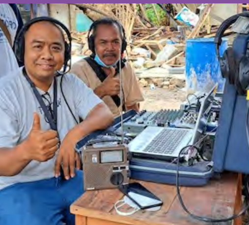
FEBC has a First Response Radio (FRR) team in some countries, who are dispatched at first notice to areas hit by natural disaster. They provide critical information and encouragement where the local communications infrastructure is damaged and unable to function.