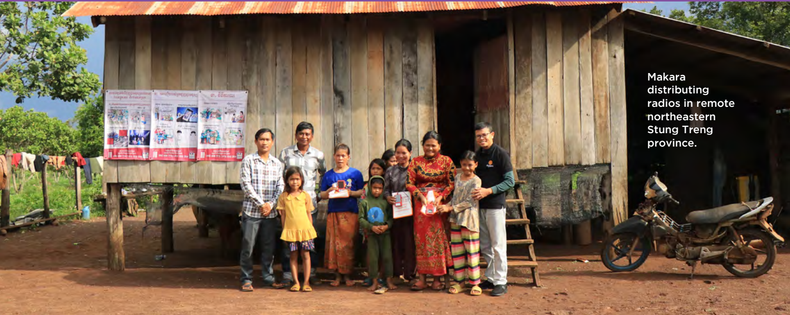
Makara distributing radios in remote northeastern Stung Treng province.