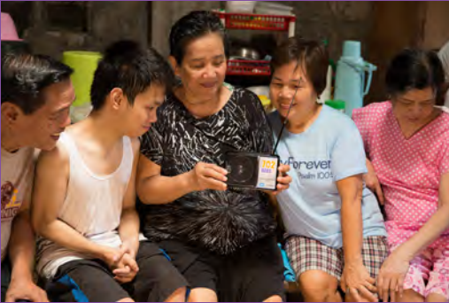
Radio is still the most widely used medium.