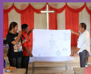
Equipping disciples to make disciples!