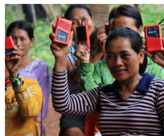
FEBC Cambodia regularly distributes shortwave radios to rural communities where FM reception is not available. Radios are also given to soldiers.