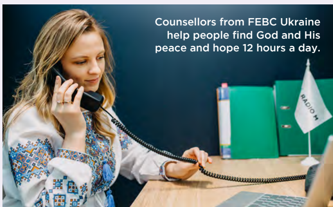
Counsellors from FEBC Ukraine help people find God and His peace and hope 12 hours a day.

24 February 2024 marks two years since war started in Ukraine. Families have been torn apart by trauma, stress, and long separation. But God is bringing new life and a peace that surpasses all understanding amid the devastation. Through FEBC's team of evangelistic counsellors, people are experiencing God's healing and restoration. Thank you for your persistent prayers!