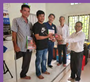
Happy Bible study students and graduates from Thlok Andong and Thnal Tasit villages in Siem Reap province.