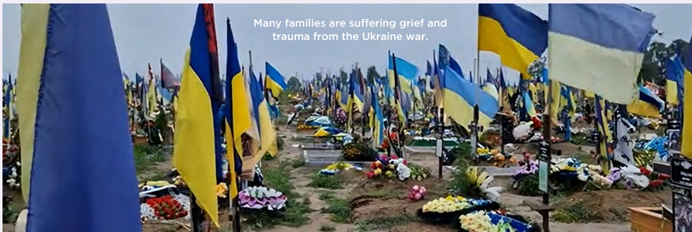
Many families are suffering grief and trauma from the Ukraine war.