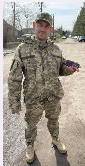
Solar powered radios are given to soldiers so they can listen to stories of hope on the frontline.