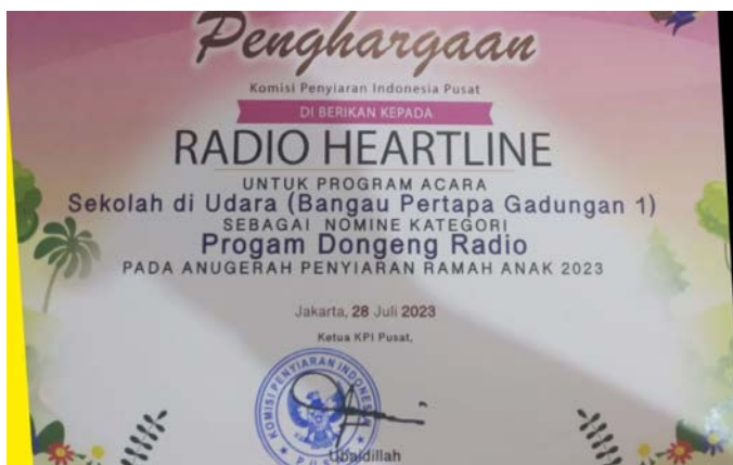
FEBC Indonesia's Heartline Radio winning the top five child-friendly radio stations in the country.

Webinars and online courses on parenting, daily radio programs for parents, children and youth, and physical conferences and counselling sessions reach a potential audience of 10 million. The radio station recently won the top five child-friendly radio stations in Indonesia!