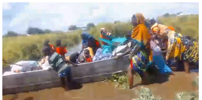
FEBC's partner in Tana River, Kenya has been serving the community through years of drought, and now, floods.

“We rallied community leaders from the government, religious groups, and the broader network of development workers to share messages of hope, give direction, and reassure the affected communities. This fostered a sense of community resilience and unity,” shared the station chairman. Emergency care packs were also distributed.