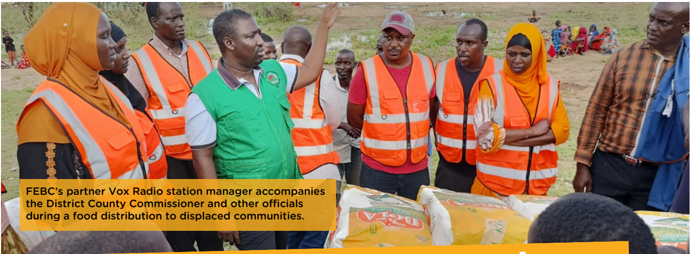
FEBC's partner Vox Radio station manager accompanies the District County Commissioner and other officials during a food distribution to displaced communities.